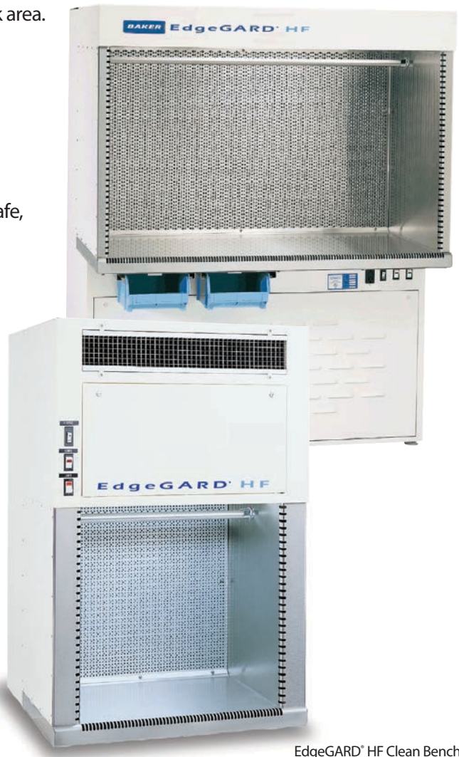
EdgeGARD® HF Clean Benches

NOTE: EdgeGARD clean benches protect product only. They are not designed to contain aerosols generated in the work area and do not protect personnel or the environment.