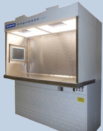
EdgeGARD® HF with PhocusRX®